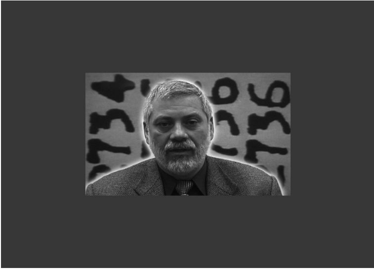
Figure 5.3 Guerrilla News Network uses new interview formats and graphics to communicate with its audience