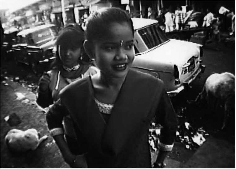
Figure 5.2 Undercover footage filmed for The Price of Youth