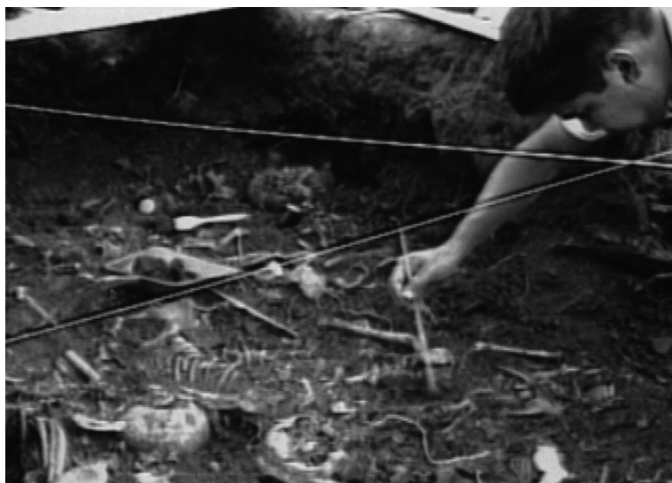
Figure 5.4 The forensic anthropologists of EAAF at work

loved ones and provide evidence to courts. It was a one-year editing project, working with 50 to 60 hours of footage shot between 1992 and 2003 in multiple countries. The film set out to map out the different stages of EAAF's work and explain to audiences in places where such gross violations have occurred and where they are considering using forensic anthropology what the process is and how it could help them.