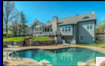
16365 Wilson Farm Drive Chesterfield • $674,500 The Barr Tradition 314-973-2843