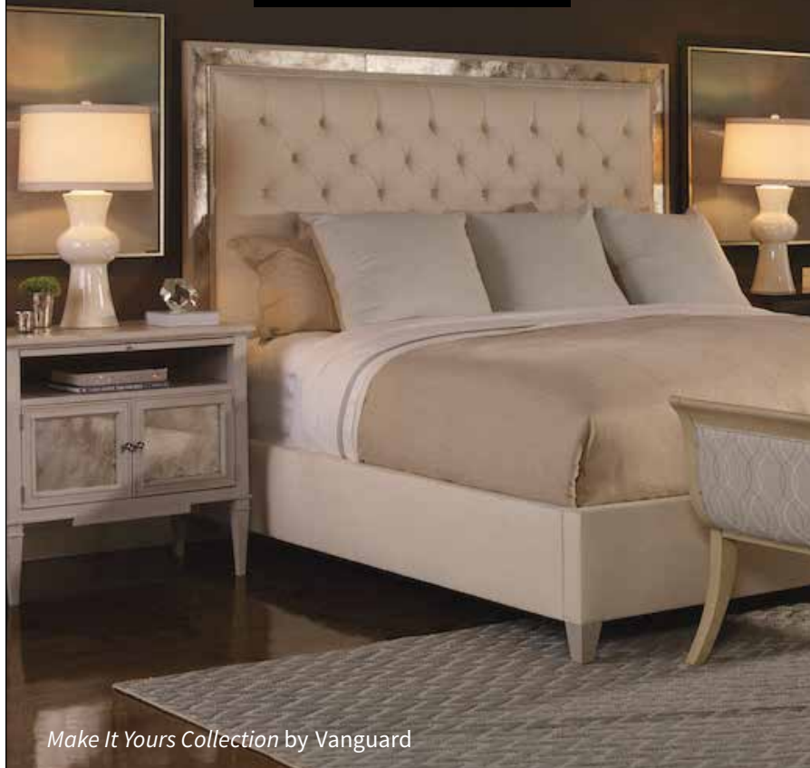
Make It Yours Collection by Vanguard