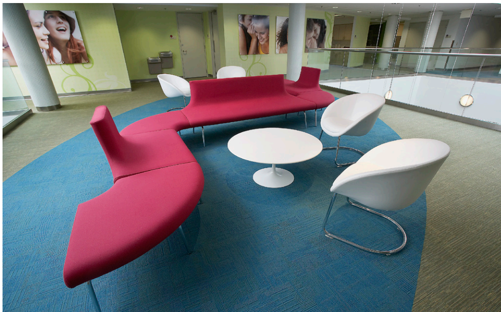
P&G Femcare division's office is an example of a physical environment that fosters innovation. The holistic, aesthetically pleasing design inspires, unifies, and encourages collaboration.

Ten years ago that target list would have been one of P&G's most closely guarded secrets—yet publishing it does nothing more than multiply the number of potential solutions. No doubt competitors study the list carefully, but if they had the answers themselves, they would already have put them into practice. Similarly, Toyota invites its commercial partners and suppliers to solve various innovation challenges.