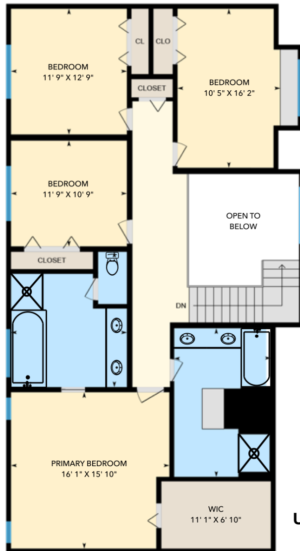
Upper Level 1459 sq.ft.