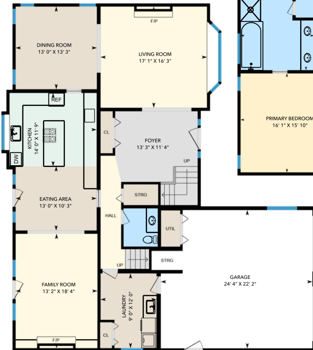
Main Level 1621 sq.ft.

1206 Pacific Drive, Tsawwassen, BC Finished 3364 sq.ft. | Garage 503 sq.ft.