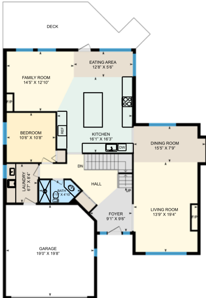
Main Level 1433 sq.ft.