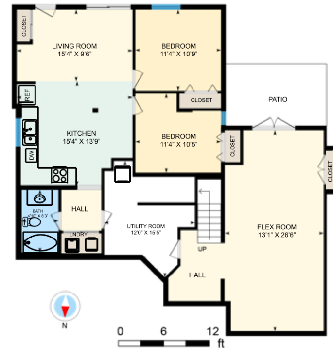
Lower Level 1374 sq.ft.