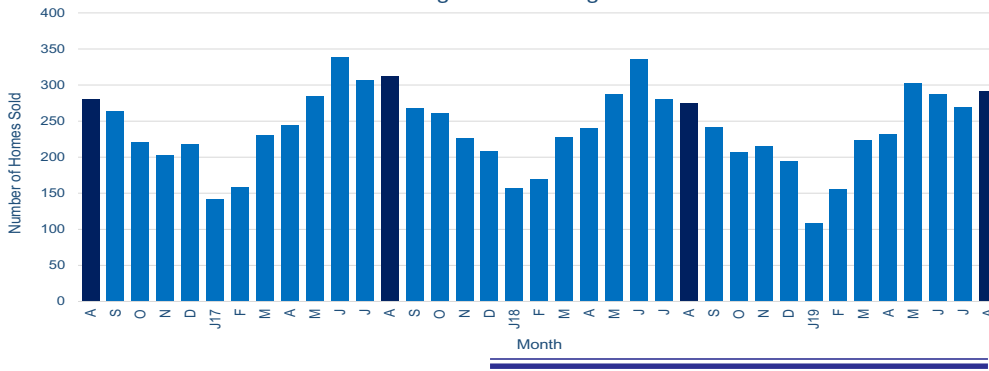
Homes Sold Fort Collins August 2016 - August 2019

Home sales experienced a bit of a resurgence in August, usually one of our slower months. There were 291 sales, a gain of 7.8% over the 270 sales in July and the second highest sales total for this year. 2019 Year-to-date home sales of 1,870 are down 5.6% from the 1,974 sales for the same period last year.