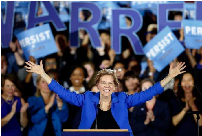
Sen. Elizabeth Warren, D-Mass., gives her victory speech at a Democratic election watch party in Boston, Tuesday, Nov. 6, 2018.