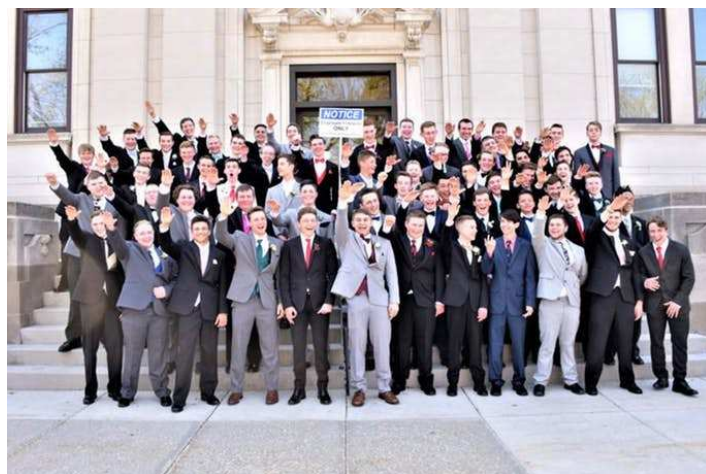
In the Spring of 2017, an image of a group of Wisconsin High School students making a collective Nazi salute went viral prompting reactions from all over the world.