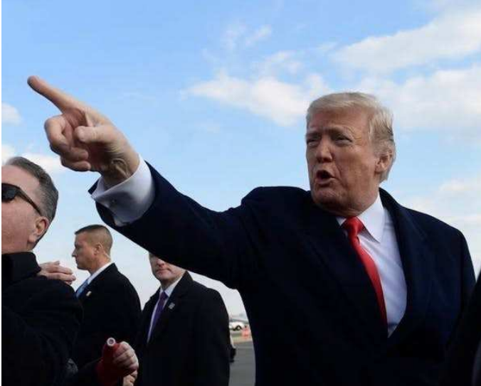
President Donald J. Trump at the Army-Navy game Saturday.

Indian Country Today E-weekly Newsletter December 12, 2018 Page 2