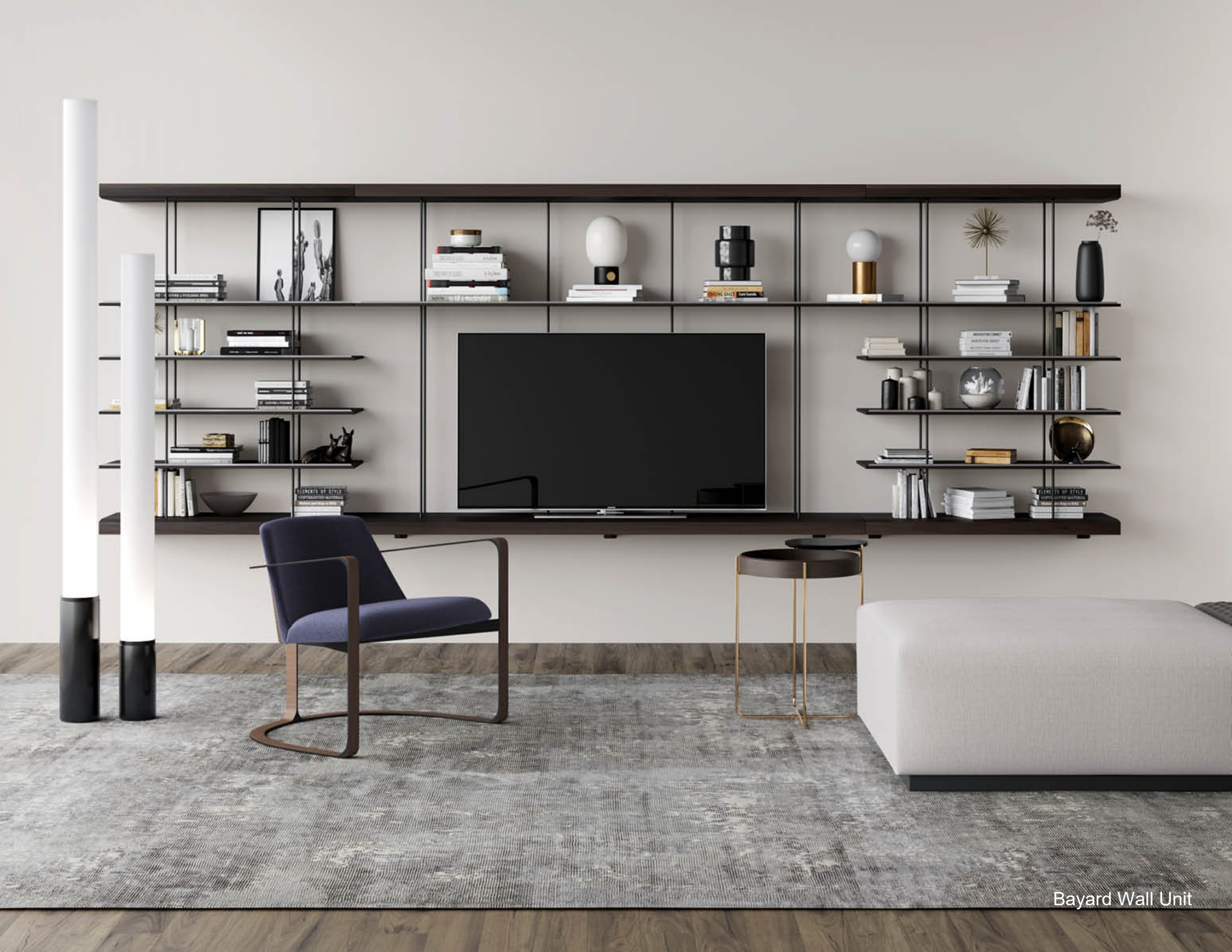
Bayard Wall Unit