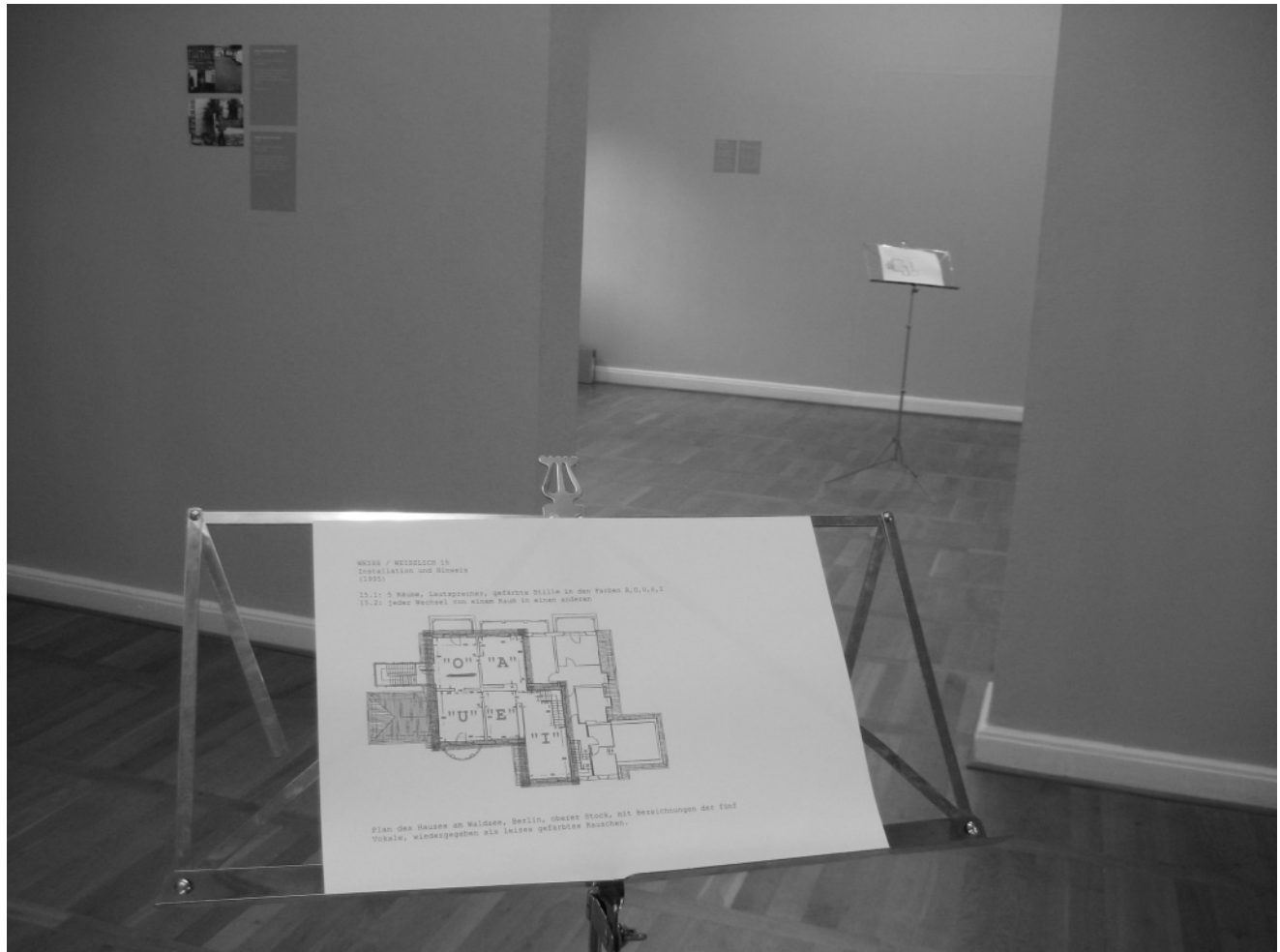
Figure 4. Ablinger's Weiss/Weisslich 15 in 2008 at the Haus am Waldsee in Berlin.

be heard in each gallery room. The volume is reduced in such a way as to make the noise barely discernible, unless one goes in search of the noise, perhaps on account of one of the information sheets on a music stand in the center of the room. (Scheib 2003)