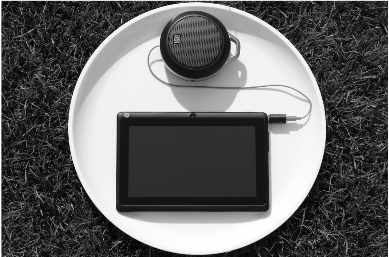
Figure 1. Close-up of a single unit, consisting of a small loudspeaker and a tablet computer.

was used to embed additional spatial effects, such as Doppler shift, reverberation, and variable comb filtering, into various individual sounds.