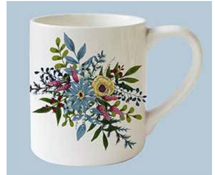
Mug concepts from "Simple Pleasures" collection

Christine Adolph's artwork is available for licensing on a wide variety of products.