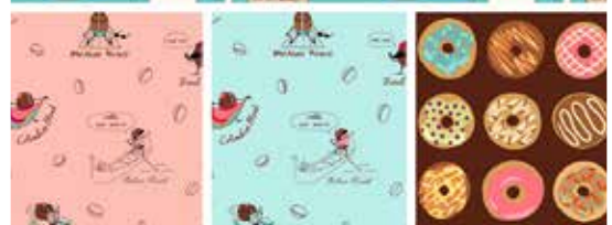
CR - Caf-fiend