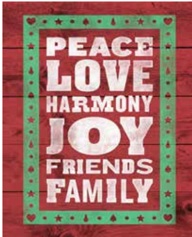
LF - Christmas 2