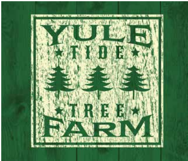
LF - Christmas 1