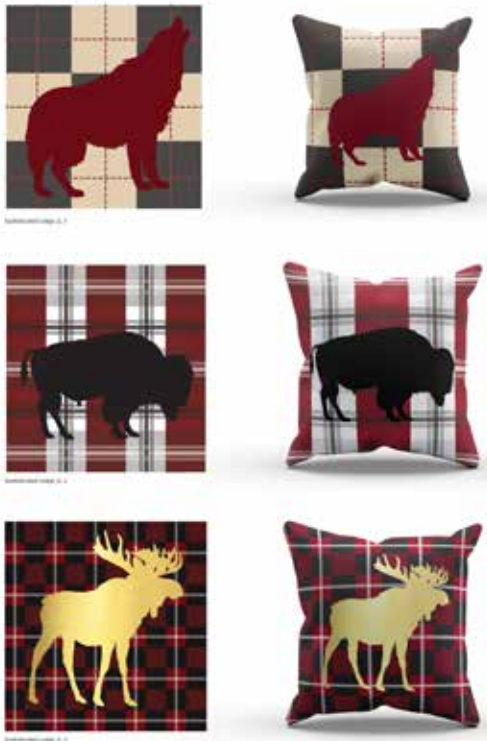
LF- Sophisticated Lodge