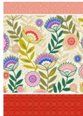
Lovely Lily Pink