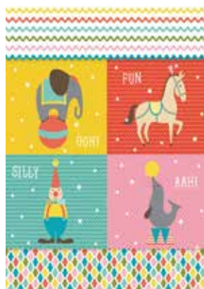
SP - Circus