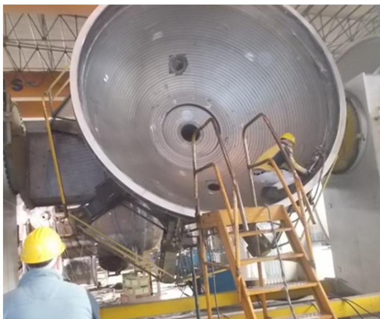
At left, a worker inspects the bottom head of a reactor vessel as it’s being manufactured. The vessel will be installed at the refinery next year.

The Detroit refinery has helped fund XXXX directed patrol shifts in Detroit neighborhoods near the refinery. The above chart shows the resulting police activity for 2016.