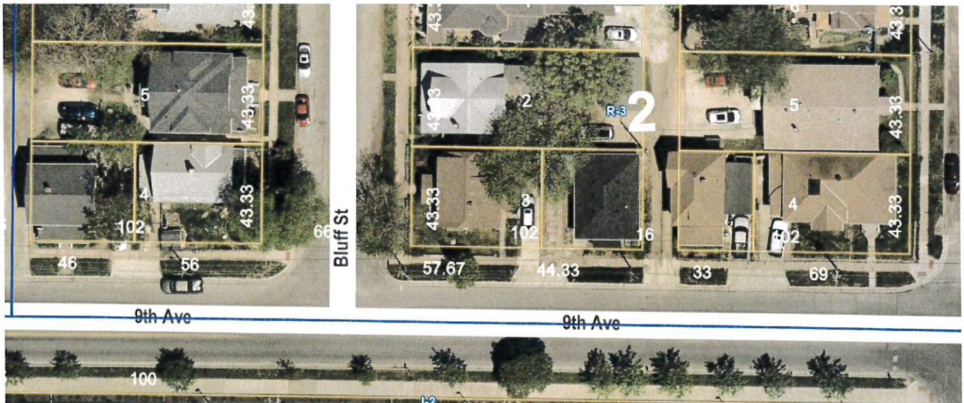
Exhibit A. A series of nonconforming lots of record along 9 th Avenue, north of the ConAgra plant, on which the base zoning regulations would make new residential development impracticable.

Currently, in order to build a residential structure in a way that does not conform to the base zoning regulations, a property must be granted a variance, otherwise the structure must conform to all site development standards for the base zoning district. Obtaining a variance is a rigid task, as an applicant must show sufficient evidence for five findings of fact that indicate hardship associated with unique conditions of the property. The Zoning Board of Adjustment cannot consider cost or design preferences when deciding whether to grant a variance. As written in the proposed Chapter 15.35 (Attachment A), infill dwelling structures would be subject to review through the Conditional Use Permit (CUP) process, as outlined in Section 15.02.090. Through this process, a property owner or developer, or their representative, would be required to submit a site-specific development