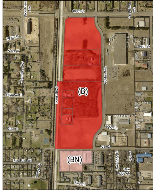
Proposed (BN) Business Neighborhood