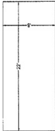
Parallel Parking Space