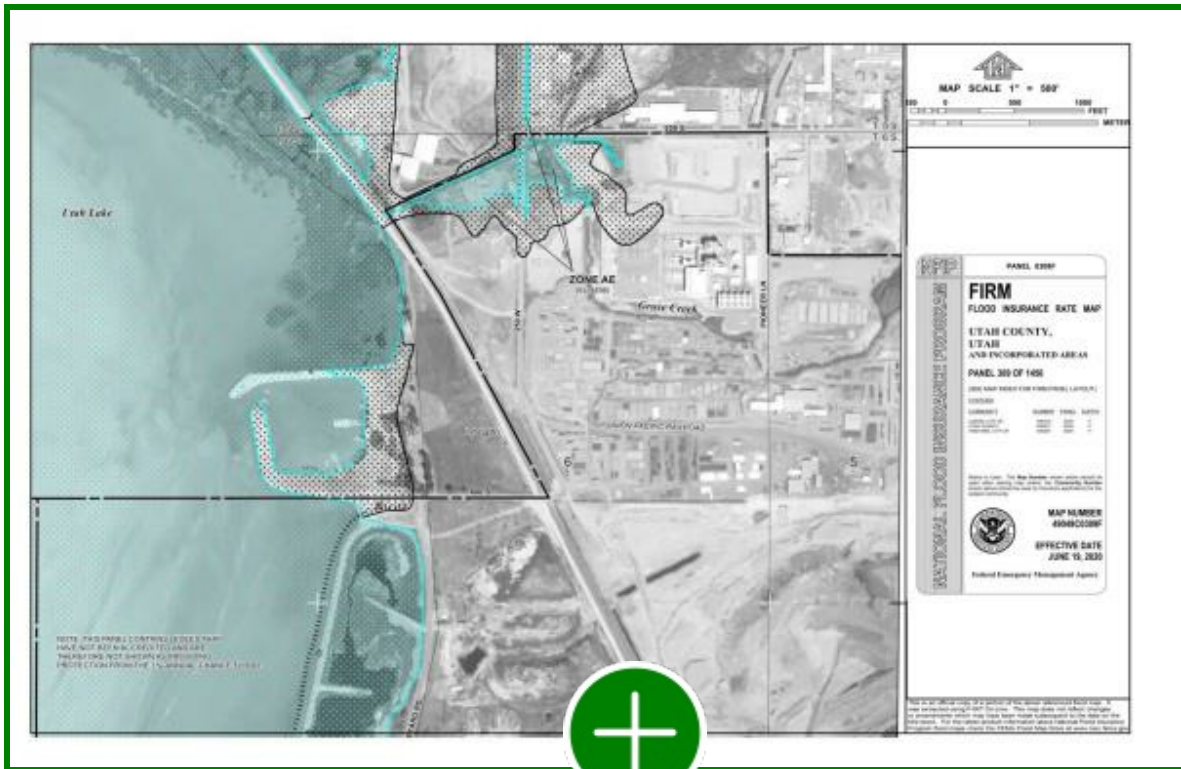
Firm Map 309F-B