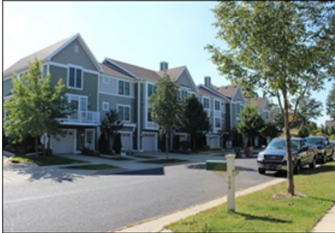
Figure 10.03(3): Examples of Appropriate Multi-Family Residential Building Materials and Colors

8. Materials—Use of Metal and Other Non-Decorative Materials. No exposed façade shall be faced with a material that presents an unfinished appearance to the public and surrounding properties. The following exterior construction materials shall not be exposed along front or street side yard facing building facades: non-decorative concrete block, cinder block, or concrete foundation walls (except for the first two feet above grade), non-decorative plywood, chipboard, T1-11, asphaltic siding, vinyl siding less than 0.044 inches of thickness, metal sheets not designed for commercial exterior walls, paneling, and other similarly inferior materials as determined by the site plan approval authority. No façade of any principal building intended for a residential, institutional, or commercial use as listed in Figure 3.04 shall be sided with metal sheets or panels or any material using non-concealed fastener systems. Buildings for industrial use as listed in Figure 3.04 shall be permitted to utilize exposed fastener metal panels. Any accessory non-residential building sided with metal sheets or panels shall be fully screened from the public rights-of-way. Pole buildings shall be prohibited in any residential, commercial, and industrial zoning district.