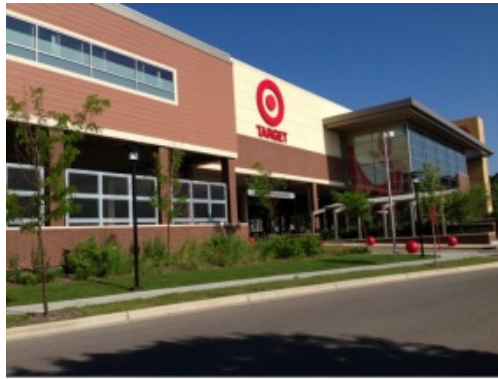
Figure 10.04(1): Examples of Appropriate Building Materials, Colors, and Architectural Design Variation