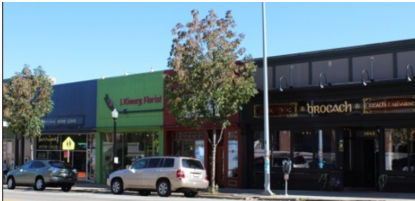
Figure 10.03 (2): Urban Example of Adjacent Building Facade Continuity