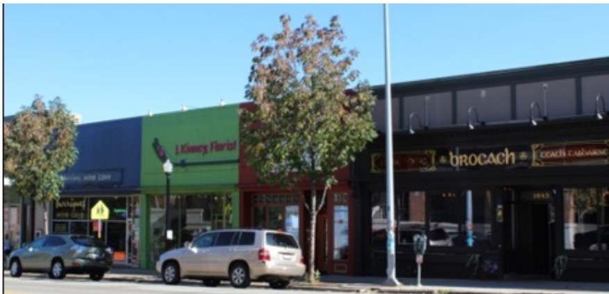
Figure 10.03 (2): Urban Example of Adjacent Building Facade Continuity