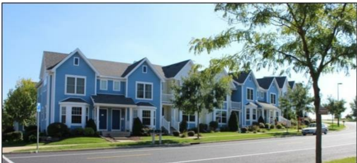
Figure 10.03(4): Examples of Appropriate Commercial Building Materials and Colors