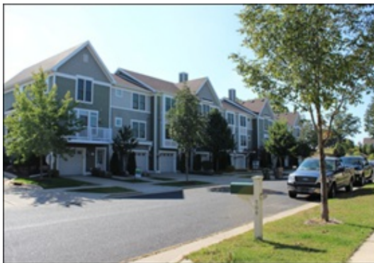
Figure 10.03(3): Examples of Appropriate Multi-Family Residential Building Materials and Colors