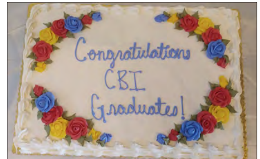
A sweet tribute to CBI graduates.