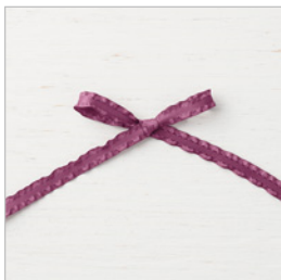
Fresh Fig 3/8" (1 Cm) Mini Ruffled Ribbon - 146945