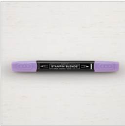
Dark Highland Heather Stampin' Blends Marker - 146883