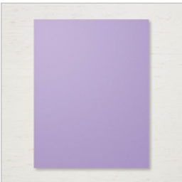
Highland Heather 8-1/2" X 11" Cardstock - 146986