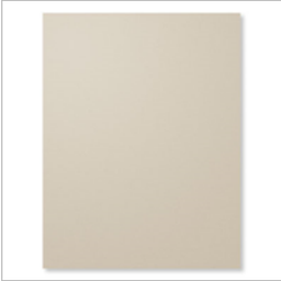
Sahara Sand 8-1/2" X 11" Cardstock - 121043