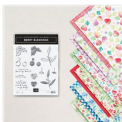
Berry Blessings Bundle (English) - 157613

Cut inside white piece with the Rectangle Stitched Die that is slightly smaller than the front piece. Your greeting piece can be cut to fit greeting, or punched ... have fun with it. Decorate as desired.