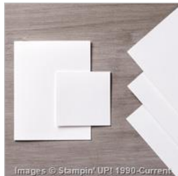
Whisper White 8-1/2" X 11" Thick Cardstock - 140272