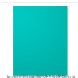
Bermuda Bay 8-1/2" X 11" Cardstock - 131197