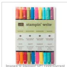
Brights Stampin' Write Markers - 131259