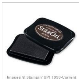
Jet Black Stazon Pad - 101406