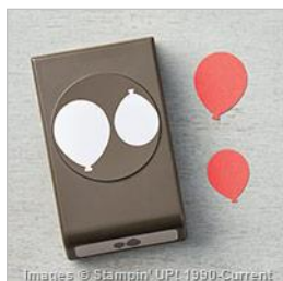
Balloon Bouquet Punch - 140609