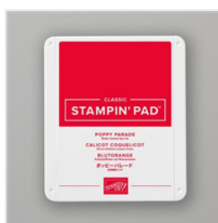
Poppy Parade Classic Stampin' Pad - 147050