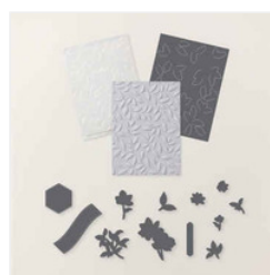
Paradise Garden Hybrid Embossing Folder - 167120