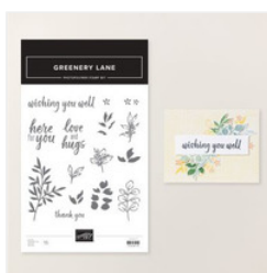
Greenery Lane Photopolymer Stamp Set (English) - 166870