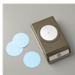
2" (5.1 Cm) Circle Punch - 133782