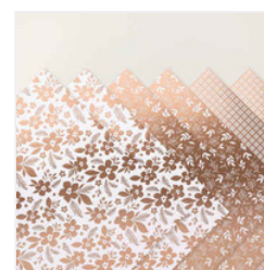
Delicate Designs 12" X 12" (30.5 X 30.5 Cm) Specialty Designer Series Paper - 167509