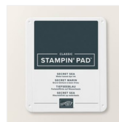
Secret Sea Classic Stampin' Pad - 165285