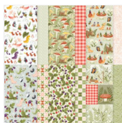
Cute As A Bug 12" X 12" (30.5 X 30.5 Cm) Designer Series Paper - 166994