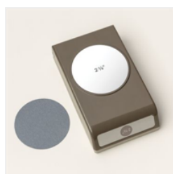
2-3/8" (6 Cm) Circle Punch - 161354