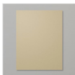
Crumb Cake 8-1/2" X 11" Cardstock - 120953