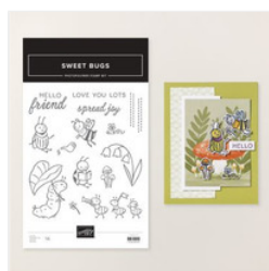
Sweet Bugs Photopolymer Stamp Set (English) - 166995