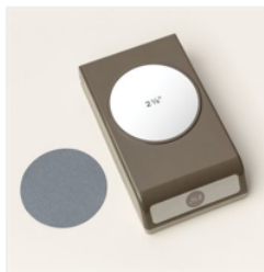
2-3/8" (6 Cm) Circle Punch - 161354