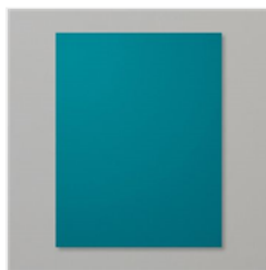
Pretty Peacock 8-1/2" X 11" Cardstock - 150880