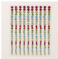
Traditional Sparkling Sequins - 165875