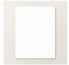
Basic White 8-1/2" X 11" Cardstock - 166780