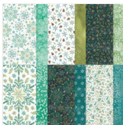
Elegant Pine Snowflakes 12" X 12" (30.5 X 30.5 Cm) Designer Series Paper - 166066