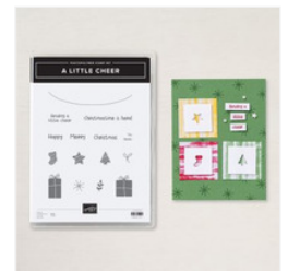
A Little Cheer Photopolymer Stamp Set (English) - 166121