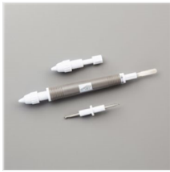
Take Your Pick - 144107

Patti Dolan patti@pspapercrafts.com www.pspapercrafts.com