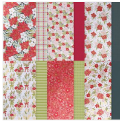
Traditions Of Christmas 12" X 12" (30.5 X 30.5 Cm) Specialty Designer Series Paper - 165853