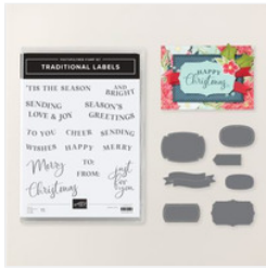
Traditional Labels Bundle (English) - 165865