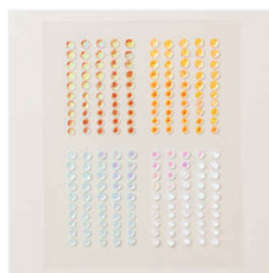
Sunset Sparkle Sequins - 167785