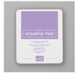
Highland Heather Classic Stampin' Pad - 147103