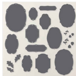
Sweet Words & Labels Dies - 167627