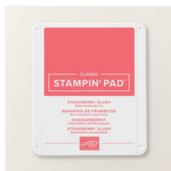
Strawberry Slush Classic Stampin' Pad - 165286