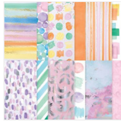
Splash Of Sparkles 12" X 12" (30.5 X 30.5 Cm) Specialty Designer Series Paper - 167200