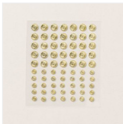
Flower Accents - 165171