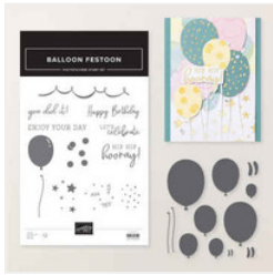
Balloon Festoon Bundle (English) - 167606