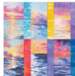
Scenic Coast 6" X 6" (15.2 X 15.2 Cm) Specialty Designer Series Paper - 167773