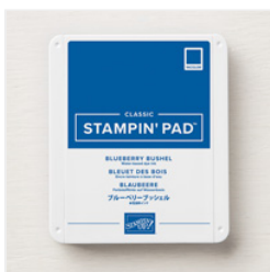
Blueberry Bushel Classic Stampin' Pad - 147138