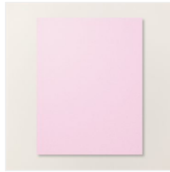
Bubble Bath 8-1/2" X 11" Cardstock - 161718