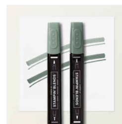
Peaceful Pine Stampin' Blends Combo Pack - 167668