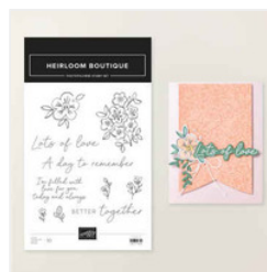
Heirloom Boutique Photopolymer Stamp Set (English) - 167725