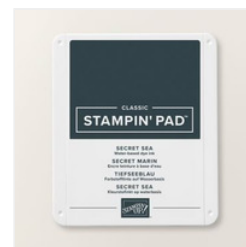
Secret Sea Classic Stampin' Pad - 165285