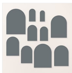
Everyday Arches Dies - 164629