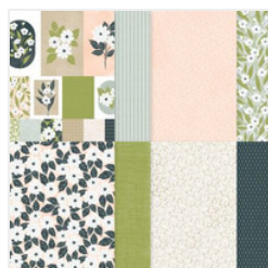
Lovely Blossoms 12" X 12" (30.5 X 30.5 Cm) Designer Series Paper - 167168