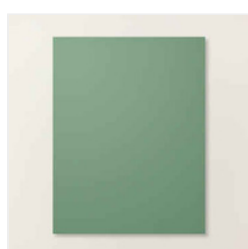
Peaceful Pine 8- 1/2" X 11" Cardstock - 167691