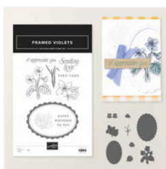
Framed Violets Bundle (English) - 168194