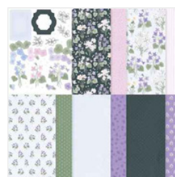
Violet Dreams 12" X 12" (30.5 X 30.5 Cm) Specialty Designer Series Paper - 168186