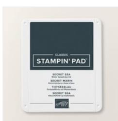
Secret Sea Classic Stampin' Pad - 165285