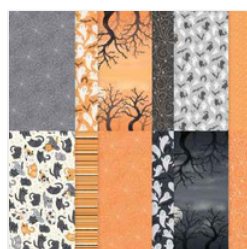
Frightfully Fun 12" X 12" (30.5 X 30.5 Cm) Designer Series Paper - 168168