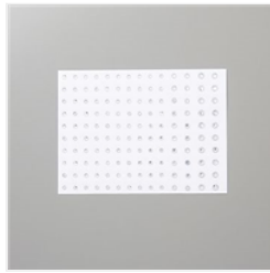
Rhinestone Basic Jewels - 144220