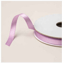
Fresh Freesia 1/4" (6.4 Mm) Satin Ribbon - 168199