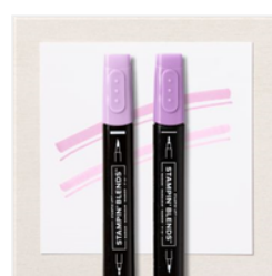
Fresh Freesia Stampin' Blends Combo Pack - 155518