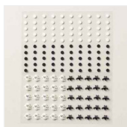
Adhesive-Backed Bats Ghosts & Dots - 168180