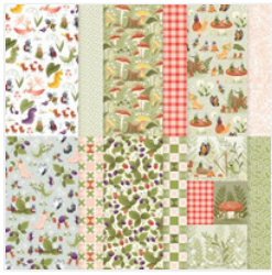
Cute As A Bug 12" X 12" (30.5 X 30.5 Cm) Designer Series Paper - 166994

Patti Dolan patti@pspapercrafts.com www.pspapercrafts.com