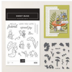
Sweet Bugs Bundle (English) - 167002