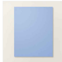
Hydrangea Hue 8-1/2" X 11" Cardstock - 167687