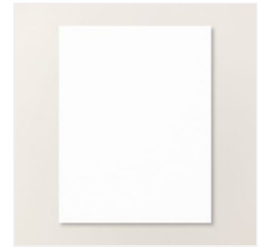
Basic White 8-1/2" X 11" Cardstock - 166780