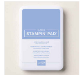
Hydrangea Hue Classic Stampin' Pad - 167677