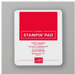
Poppy Parade Classic Stampin' Pad - 147050