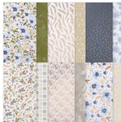
Delicate Dreams 12" X 12" (30.5 X 30.5 Cm) Specialty Designer Series Paper - 167498