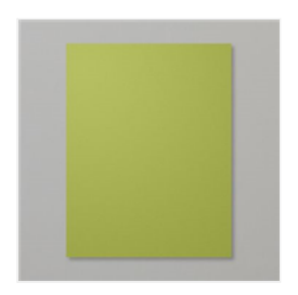
Old Olive 8-1/2" X 11" Cardstock -