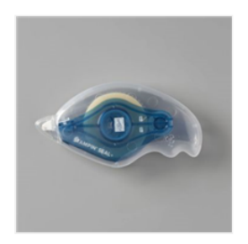
<u>Stampin' Seal+ -</u> <u>149699</u>