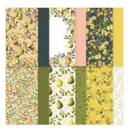
Painterly Pears 12" X 12" (30.5 X 30.5 Cm) Designer Series Paper -