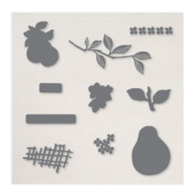
Perfectly Pears Dies - 166153