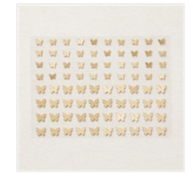
Brushed Brass Butterflies 158136