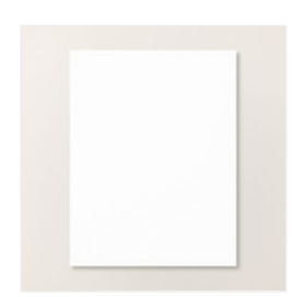
Basic White 8-1/2" X 11" Cardstock 166780