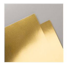
Gold Foil Sheets -132622