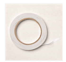
<u>Tear & Tape</u> <u>Adhesive - 154031</u>