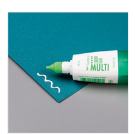
Multipurpose Liquid Glue -110755