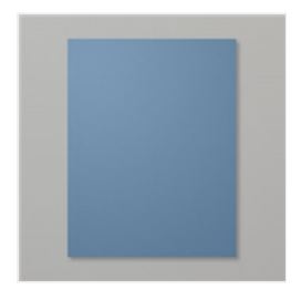
Misty Moonlight 8-1/2" X 11" Cardstock -153081