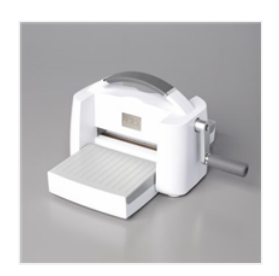
Stampin' Cut & Emboss Machine -149653