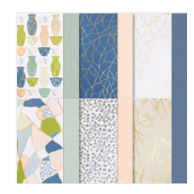
Kintsugi Inspirations 12" X 12" (30.5 X 30.5 Cm) Specialty Designer Series Paper - 165159