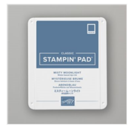
Misty Moonlight Classic Stampin' Pad - 153118