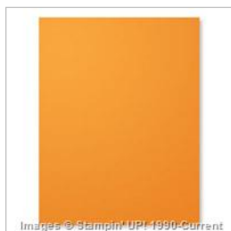
Pumpkin Pie 8-1/2" X 11" Cardstock - 105117