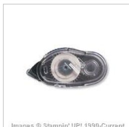
Snail Adhesive - 104332