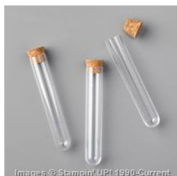
Treat Tubes - 144612