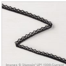
Vintage Crochet Trim - 144611