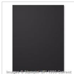
Basic Black 8-1/2" X 11" Cardstock - 121045