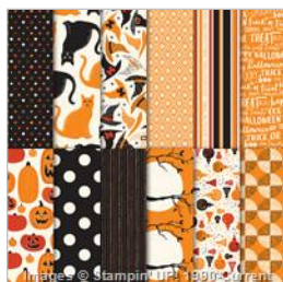
Spooky Night Designer Series Paper - 144610