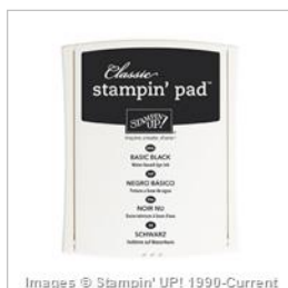
Basic Black Classic Stampin' Pad - 126980