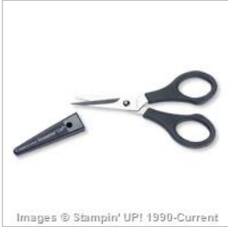
Paper Snips - 103579