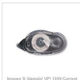
Snail Adhesive - 104332