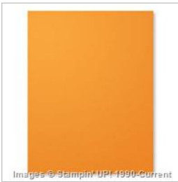
Pumpkin Pie 8-1/2" X 11" Cardstock - 105117