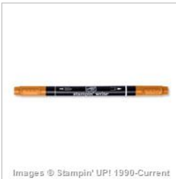
Pumpkin Pie Stampin' Write Marker - 105115