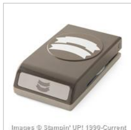
Duet Banner Punch - 141483