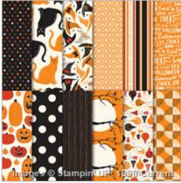
Spooky Night Designer Series Paper - 144610