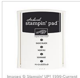
Basic Black Archival Stampin' Pad - 140931