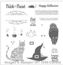
Spooky Cat Photopolymer Stamp Set - 144749