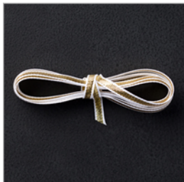
Gold 1/8" (3.2 Mm) Ribbon - 134583