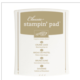
Crumb Cake Classic Stampin' Pad - 126975