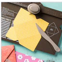
Envelope Punch Board - 133774