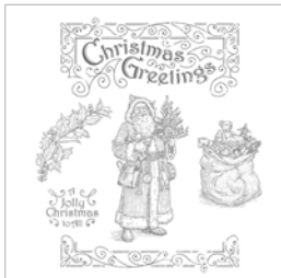
Father Christmas Wood-Mount Stamp Set - 142122