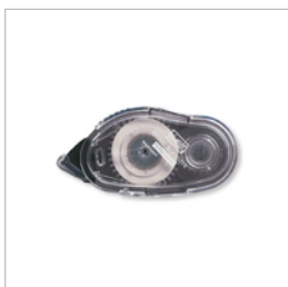
Snail Adhesive - 104332