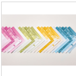
Color Theory Designer Series Paper Stack - 144193