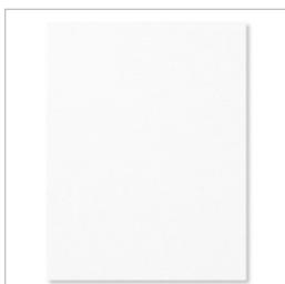
Whisper White 8-1/2" X 11" Cardstock - 100730