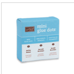
Mini Glue Dots - 103683