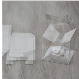
Clear Tiny Treat Boxes