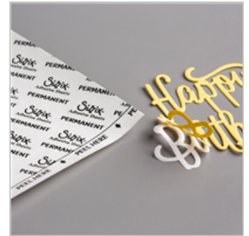
Multipurpose Adhesive Sheets