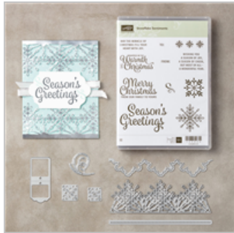
Snowflake Sentiments Clear-Mount Bundle*