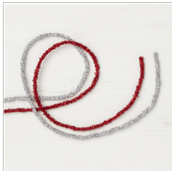
Mini Tinsel Trim Combo Pack*