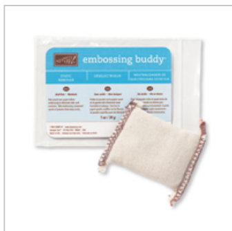
Embossing Buddy 103083