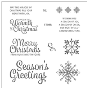
Snowflake Sentiments Clear-Mount Stamp Set 144820