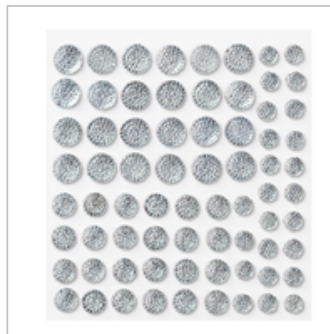
Clear Faceted Gems