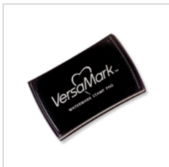
Versamark Pad 102283