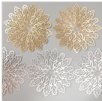
Foil Snowflakes 144642