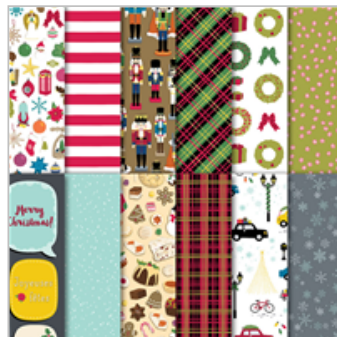
Christmas Around The World Designer Series Paper 144629