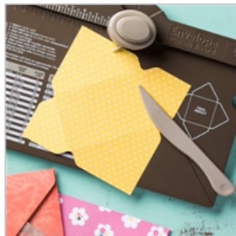
Envelope Punch Board 133774