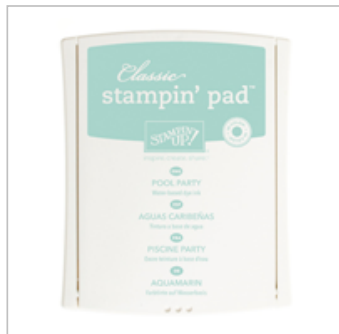
Pool Party Classic