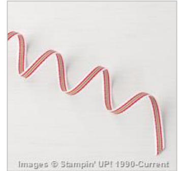
Quilted Christmas 1/4" (6.4 Mm) Ribbon