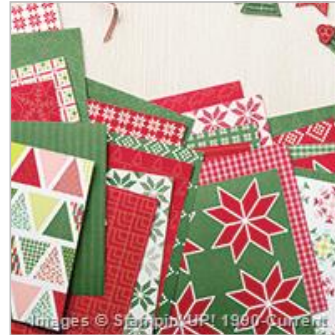
Quilted Christmas 6" X 6" (15.2 X 15.2 Cm) Designer Series