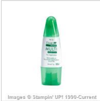
Multipurpose Liquid Glue