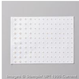
Pearl Basic Jewels