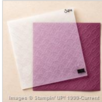
Quilt Top Textured Impressions Embossing Folder