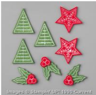
Stitched Felt Embellishments