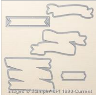
Bunch Of Banners Framelits Dies