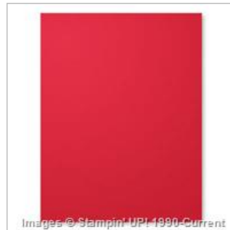
Real Red 8-1/2" X 11" Cardstock