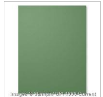
Garden Green 8-1/2" X 11" Cardstock