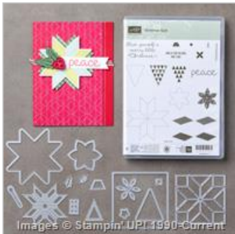
Christmas Quilt Photopolymer Bundle