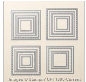
Layering Squares Framelits Dies