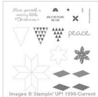
Christmas Quilt Photopolymer Stamp Set