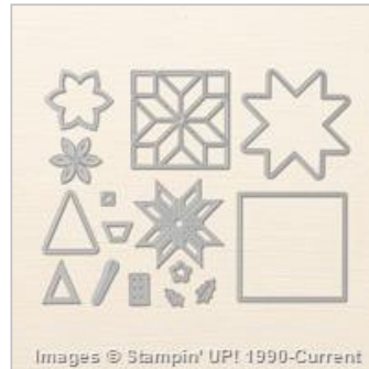
Quilt Builder Framelits Dies