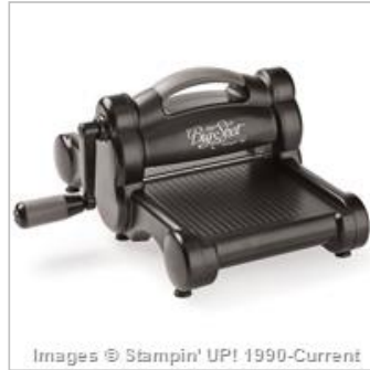
Big Shot 143263