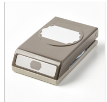
Everyday Label Punch