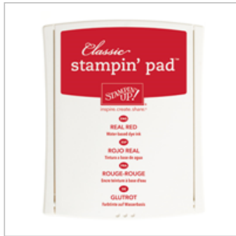
Real Red Classic Stampin' Pad