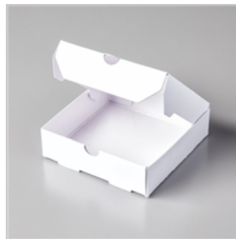
Mini Pizza Boxes