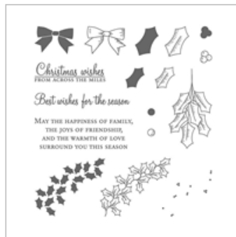
Holly Berry Happiness Photopolymer Stamp Set