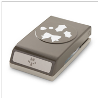
Holly Berry Builder Punch