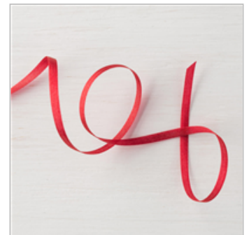
Real Red 1/8" (3.2 Mm) Solid Ribbon