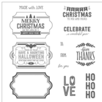
Labels To Love Clear-Mount Stamp Set

attach completed tag onto the top of the pizza box with Dimensionals.