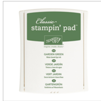
Garden Green Classic Stampin' Pad