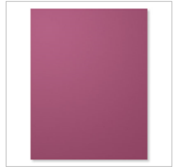
Rich Razzleberry 8- 1/2" X 11" Cardstock