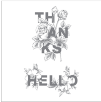
Floral Statements Clear-Mount Stamp Set