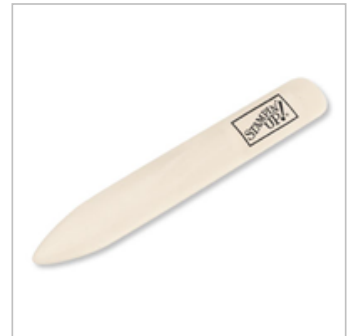
Bone Folder 102300