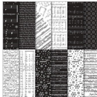
Merry Music Specialty Designer Series