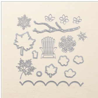
Seasonal Layers Thinlits Dies