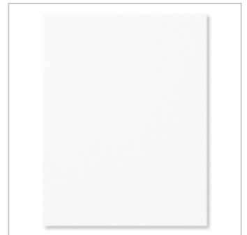
Whisper White 8-1/2" X 11" Cardstock