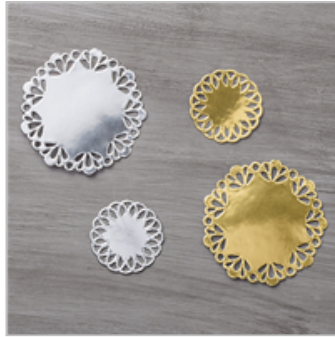
Metallic Foil Doilies 138392