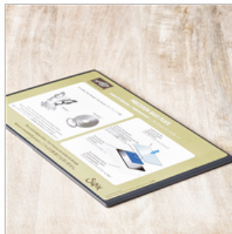
Precision Base Plate