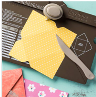
Envelope Punch Board 133774