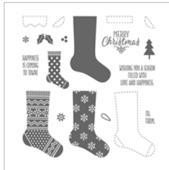
Hang Your Stocking Photopolymer Stamp