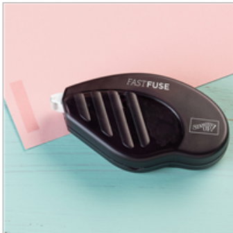
Fast Fuse Adhesive 129026