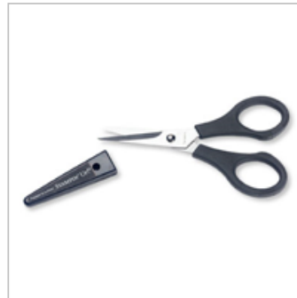
Paper Snips 103579