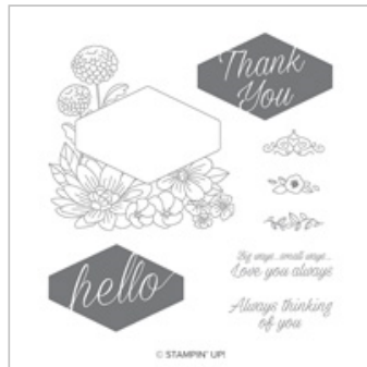
Accented Blooms Wood-Mount Stamp Set