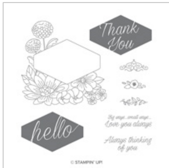
Accented Blooms Clear-Mount Stamp Set