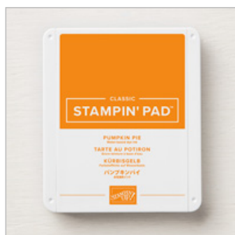
Pumpkin Pie Classic