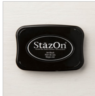
Jet Black Stazon Ink Pad