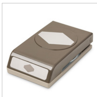
Tailored Tag Punch