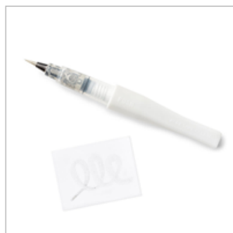
Clear Wink Of Stella