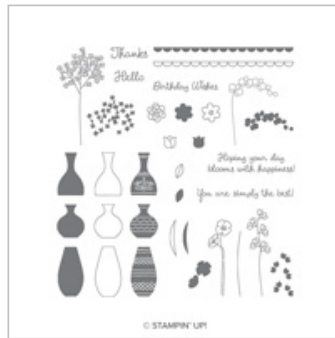
Varied Vases Photopolymer Stamp Set