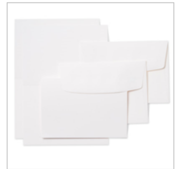
Whisper White Note Cards & Envelopes