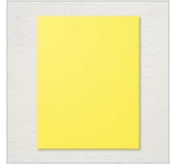
Pineapple Punch 8-1/2" X 11" Cardstock