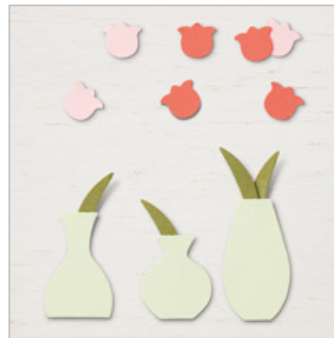
Vases Builder Punch