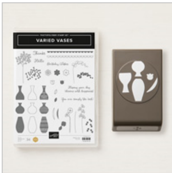
Varied Vases Photopolymer Bundle