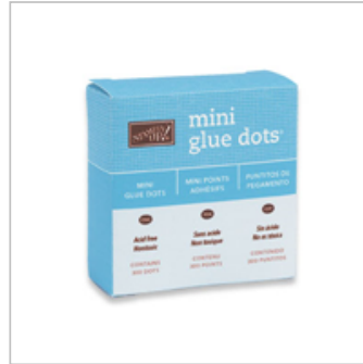
Mini Glue Dots