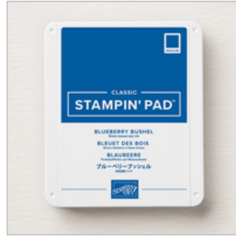
Blueberry Bushel Classic Stampin' Pad