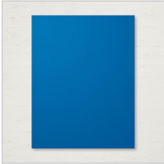
Blueberry Bushel 8-1/2" X 11" Cardstock