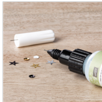
Fine-Tip Glue Pen