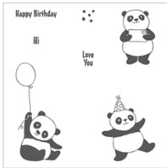
Party Pandas Clear-Mount Stamp Set