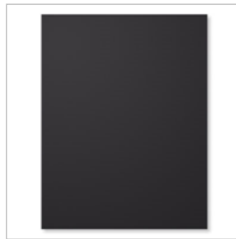
Basic Black 8-1/2" X 11" Cardstock