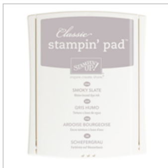
Smoky Slate Classic Stampin' Pad