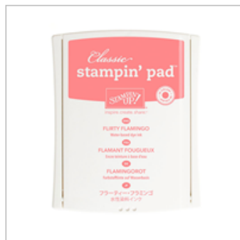
Flirty Flamingo Classic Stampin' Pad