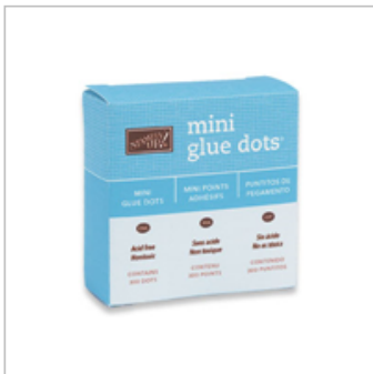
Mini Glue Dots