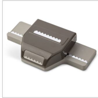
Ticket Tear Border Punch