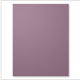
Perfect Plum 8-1/2" X 11" Cardstock

Margie Calenda mybroomstick01@gmail.com magicalmargie.blogspot.com