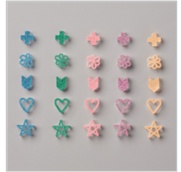
2016-2018 In Color Glitter Acrylic Shapes