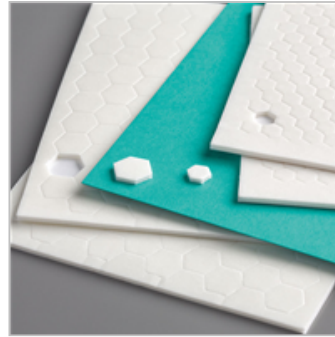
Mini Stampin' Dimensionals