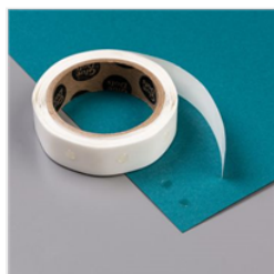
Mini Glue Dots - 103683