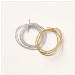
Simply Elegant Trim - 155766