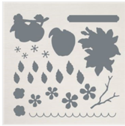
Apple Blossoms Dies - 160255

megumih4stamps@hotmail.com https://www.megumisstampinretreat.com