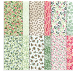
Painted Christmas 12" X 12" (30.5 X 30.5 Cm) Designer Series Paper - 156292