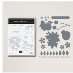
Apple Harvest Bundle (English) - 162526