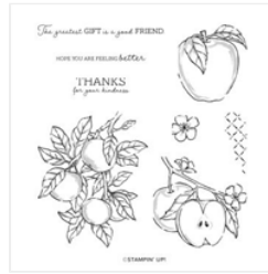
Apple Harvest Cling Stamp Set (English) - 159944