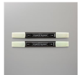
Soft Sea Foam Stampin' Blends Combo Pack - 154902