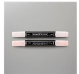
Petal Pink Stampin' Blends Combo Pack - 154893