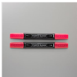
Real Red Stampin' Blends Combo Pack - 154899