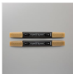
Soft Suede Stampin' Blends Combo Pack - 154906