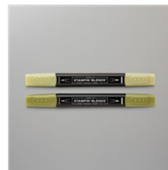
Old Olive Stampin' Blends Combo Pack - 154892