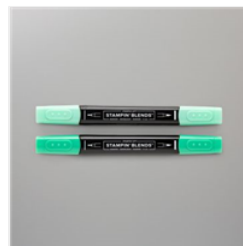
Shaded Spruce Stampin' Blends Combo Pack - 154903