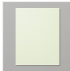
Soft Sea Foam 8- 1/2" X 11" Cardstock - 146988