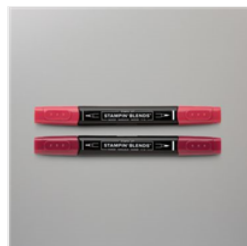
Cherry Cobbler Stampin' Blends Combo Pack - 154880