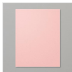
Blushing Bride 8-1/2" X 11" Cardstock - 131198