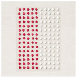
Resin Hearts Embellishment - 154578