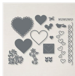
Many Hearts Dies - 154308