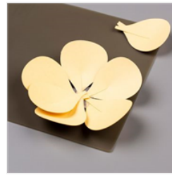
Silicone Craft Sheet - 127853