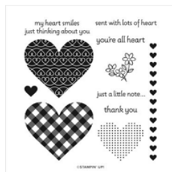
Lots Of Heart Photopolymer Stamp Set - 154348