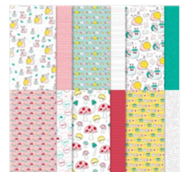
Snail Mail Designer Series Paper - 154577