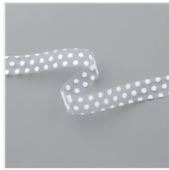
Whisper White 5/8\" (1.6 Cm) Polka Dot Tulle Ribbon - 146912