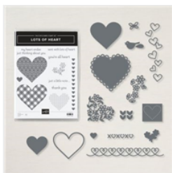
Lots Of Heart Bundle (English) - 156202