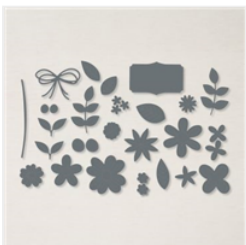
Pierced Blooms Dies - 154312