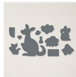
Kangaroo Dies - 154334