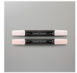
Petal Pink Stampin' Blends Combo Pack - 154893