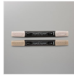
Crumb Cake Stampin' Blends Combo Pack - 154882