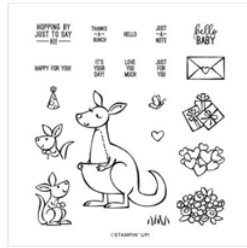
Kangaroo & Company Photopolymer Stamp Set - 154502