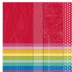
Brights 6" X 6" (15.2 X 15.2 Cm) Designer Series Paper - 152487