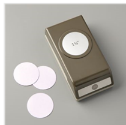
1-1/2" (3.8 Cm) Circle Punch - 138299