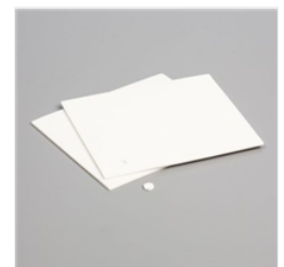
Mini Stampin' Dimensionals - 144108