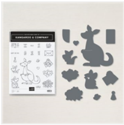
Kangaroo & Company Bundle - 156269