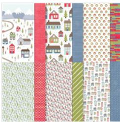
Trimming The Town Designer Series Paper - 153491