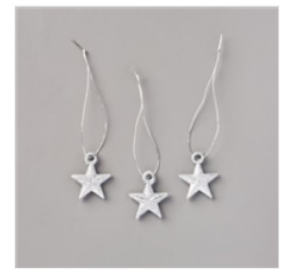
Glitter Star Ornaments - 153543