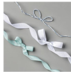
Flowers For Every Season Ribbon Combo Pack - 153620