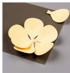
Silicone Craft Sheet - 127853