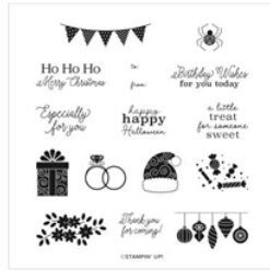
Stamp Set Cling Little Treats - 153376