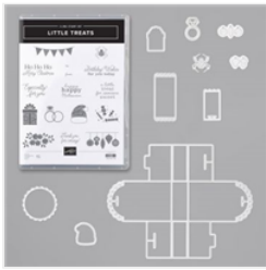
Little Treats Bundle - 155204

Angie Juda http://orderwithangie.com angie@chicnscratch.com ChicnScratch.com