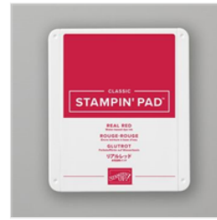
Real Red Classic Stampin' Pad - 147084