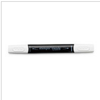
Stampin' Blends Color Lifter