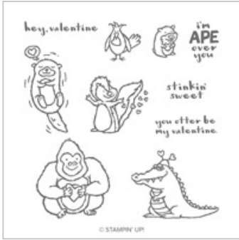
Hey Love Cling Stamp Set