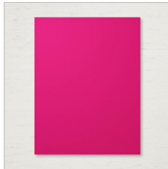
Lovely Lipstick 8-1/2" X 11" Cardstock