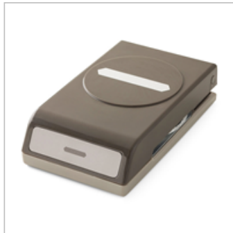
Classic Label Punch