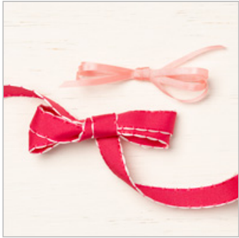
All My Love Ribbon Combo Pack