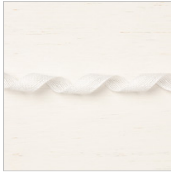
Whisper White 5/8" (1.6 Cm) Flax Ribbon