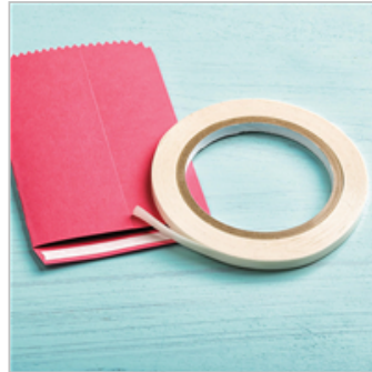
Tear & Tape Adhesive