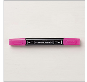
Dark Lovely Lipstick Stampin' Blends Marker