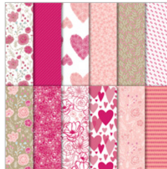
All My Love 12" X 12" (30.5 X 30.5 Cm) Designer Series Paper