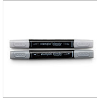
Smoky Slate Stampin' Blends Markers Combo Pack