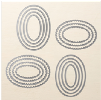
Layering Ovals Framelits Dies