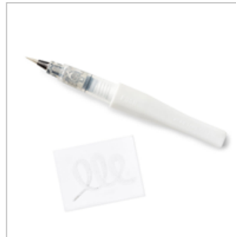
Clear Wink Of Stella Glitter Brush