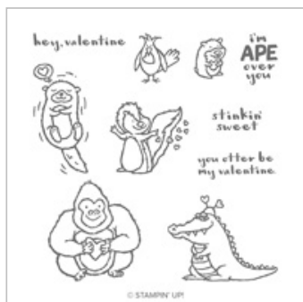
Hey Love Cling Stamp Set