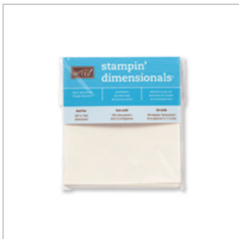
Stampin' Dimensionals 104430