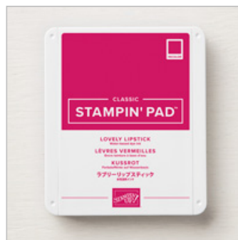
Lovely Lipstick Classic Stampin' Pad