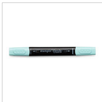
Pool Party Dark Stampin' Blends Marker