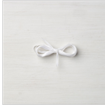
Whisper White 1/8" Sheer Ribbon 144172