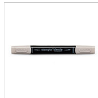
Crumb Cake Light Stampin' Blends Marker