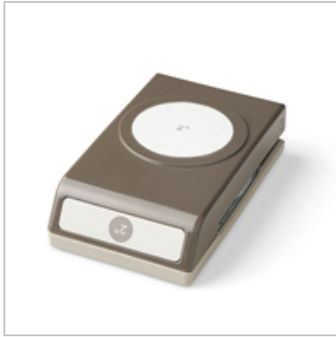
2" (5.1 Cm) Circle Punch 133782

Angie Juda http://orderwithangie.com angie@chicnscratch.com ChicnScratch.com