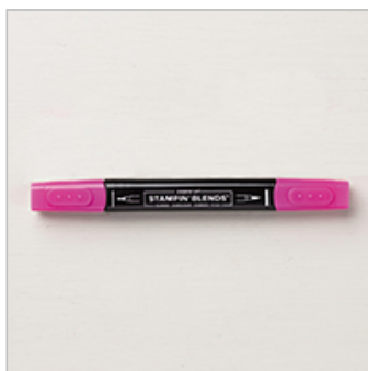
Dark Lovely Lipstick Stampin' Blends Marker