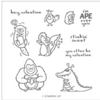
Hey Love Cling Stamp Set