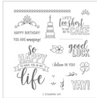
Amazing Life Photopolymer Stamp Set