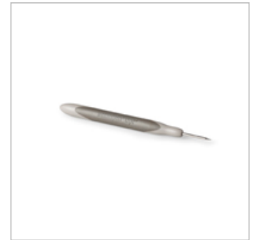
Paper-Piercing Tool 126189