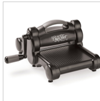
Big Shot 143263