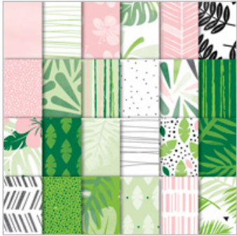
Tropical Escape 6" X 6" (15.2 X 15.2 Cm)