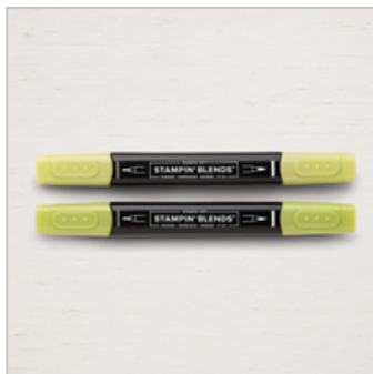
Granny Apple Green Stampin' Blends Markers Combo Pack