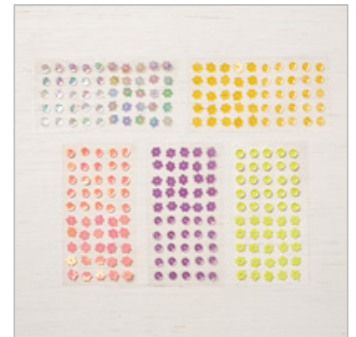
Gingham Gala Adhesive-Backed Sequins