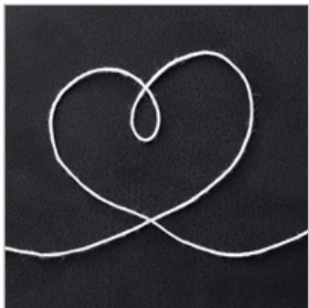
Whisper White Solid Baker's Twine