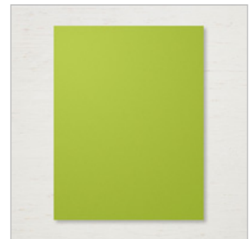
Granny Apple Green 8-1/2" X 11" Cardstock