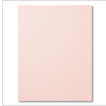
Powder Pink 8-1/2" X 11" Cardstock