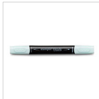
Pool Party Light Stampin' Blends Marker