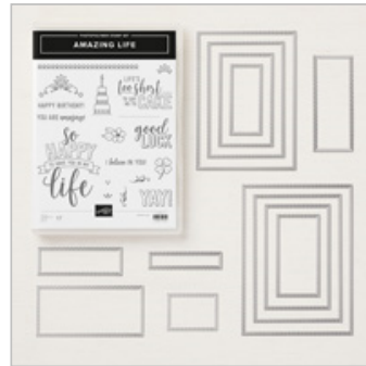
Amazing Life Photopolymer Bundle