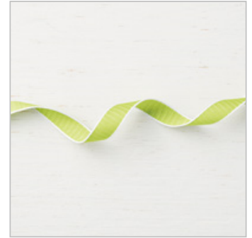
Granny Apple Green 1/2" (1.3 Cm)