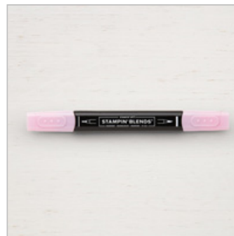
Light Flirty Flamingo Stampin' Blends Marker