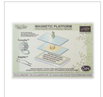
Magnetic Platform 130658