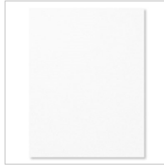
Whisper White 8-1/2" X 11" Cardstock