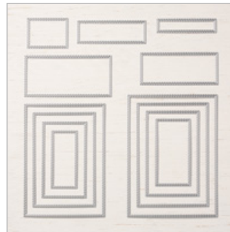
Rectangle Stitched Framelits Dies