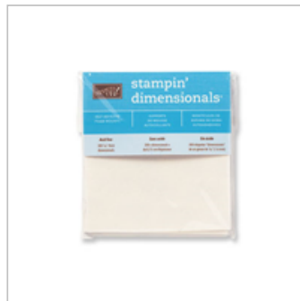
Stampin' Dimensionals 104430