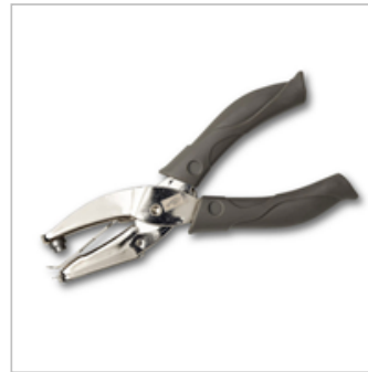
1/8" (3.2 Mm) Circle Punch 134365