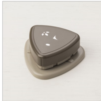
Detailed Trio Punch 146320